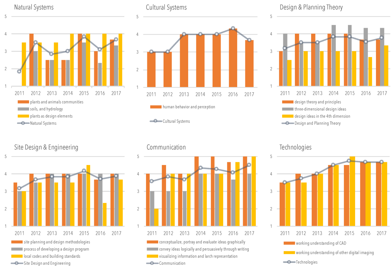
Chart 3 shows individual charts by competency group. Each chart displays individual scores for each competency for each year. The line graph in each chart indicates the average score for each competency group for each year.

Assessment scores show that most of the student competencies rank between the understanding and the application level. This means the BLA students have developed, from previous studios, enough competencies at the understanding level that allow them to move forward and advance their competencies to higher levels. This improvement is more evident in the last years of the assessment. The challenge for this course is to maintain the levels achieved in 2014 and 2015. The challenge for the Senior level studios is to make sure the students are presented with opportunities to achieve competencies from application to fully developed levels.